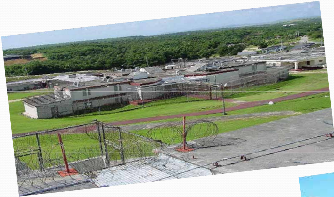
Department of Corrections