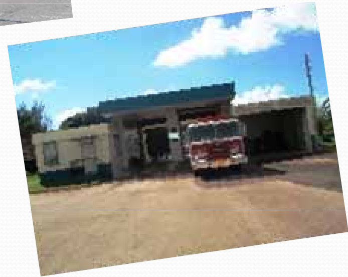
Village Fire Station