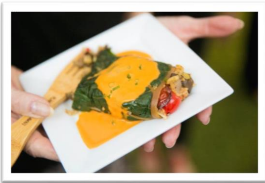
Serve buffet style, not individually wrapped