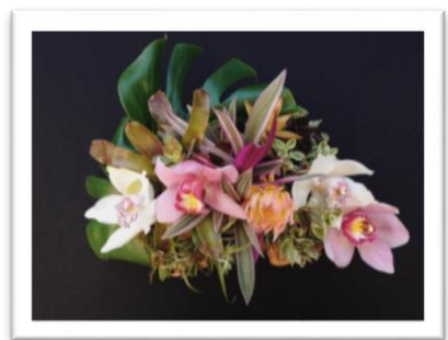
Venue has drought tolerant plants including succulents and air plants