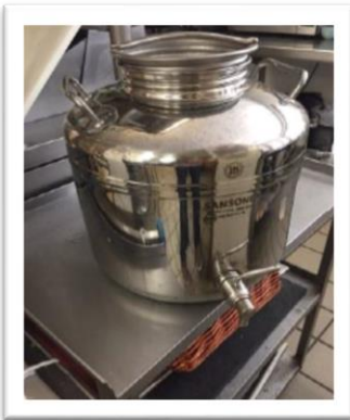
Water is provided in large dispensers