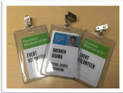
Reusable name badges (used for volunteers and staff)