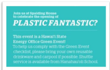
Provide shuttle service