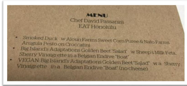
Vegetarian/ Vegan options are provided. Information provided on the sustainable qualities of the food