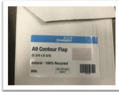
Invitations are reusable drink coasters, envelopes are made with 100% recycled paper.