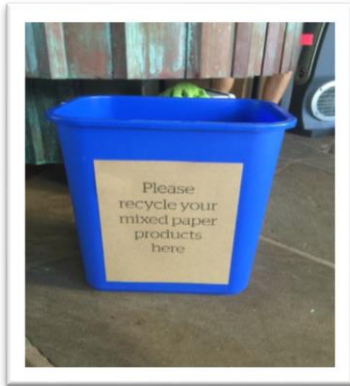
Sufficient recycling bins, no other trash