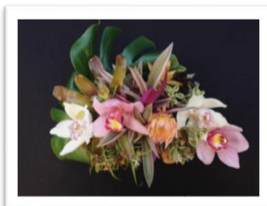
Centerpieces and decorations that are sustainable using plants that can be repotted