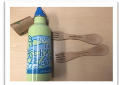
Reusable/ refillable containers for drinks