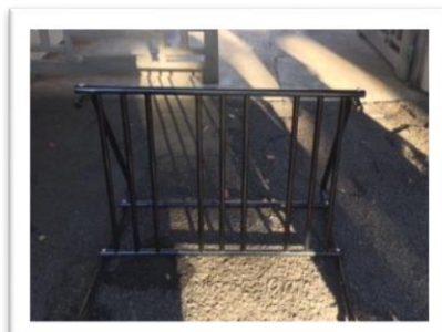
Secure bicycle storage