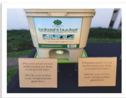
Compost at the event