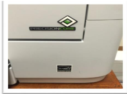
Equipment used is Energy Star (Printer for envelopes)