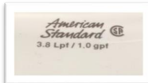
Facility has low flow fixtures