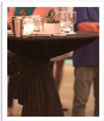
Linen tableware is reusable