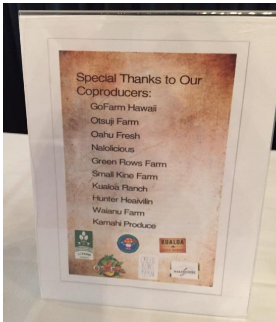
Work with local and green vendors