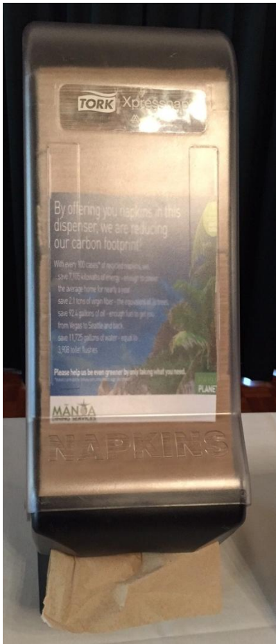
Sustainable napkins from UH and green info