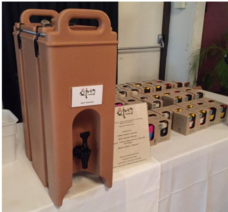
Selling reusable mugs