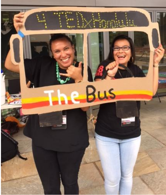
Encouraging participants to take the bus